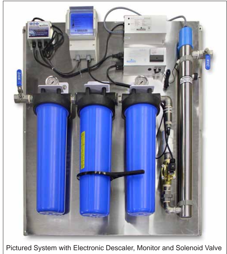
Pictured System with Electronic Descaler, Monitor and Solenoid Valve

This residential/commercial water purification system offers very efficient water treatment at a low cost per unit volume.