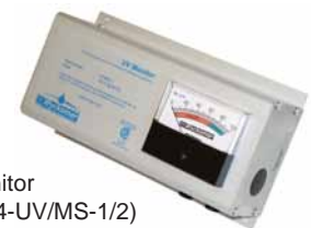
UV Monitor (Part # 4-UV/MS-1/2)

Monitoring System - For those applications that require fail-safe operation, a monitoring system can be added. This consists of a sensor that measures the intensity of the UV light in real-time, and displays it on a meter face on the monitor. In case the intensity goes below the recommended dosage for drinking water, the monitor can trigger a solenoid valve to shut off the flow of water until the problem has been rectified.