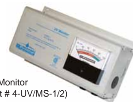
UV Monitor (Part # 4-UV/MS-1/2)

Monitoring System - For those applications that require fail-safe operation, a monitoring system can be added. This consists of a sensor that measures the intensity of the UV light in real-time, and displays it on a meter face on the monitor. In case the intensity goes below the recommended dosage for drinking water, the monitor can trigger a solenoid valve to shut off the flow of water until the problem has been rectified.