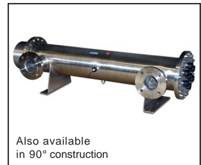
Also available in 90° construction