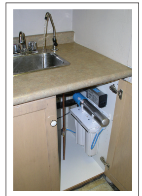
Typical Installation for drinking water under the sink