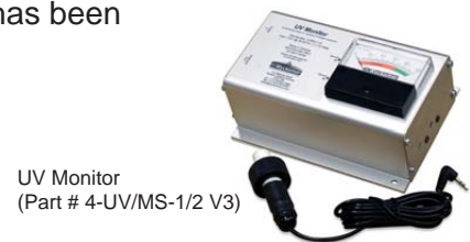
UV Monitor (Part # 4-UV/MS-1/2 V3)

Monitoring System - For those applications that require fail-safe operation, a monitoring system can be added. This consists of a sensor that measures the intensity of the UV light in real-time, and displays it on a meter face on the monitor. In case the intensity goes below the recommended dosage for drinking water, the monitor can trigger a solenoid valve to shut off the flow of water until the problem has been rectified.