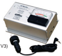
UV Monitor (Part # 4-UV/MS-1/2 V3)

Special Filtration - If other contaminants are present, such as Arsenic, Fluoride, Nitrate or other pollutants, or if the pH needs to be adjusted, additional filtration levels can easily be added to this system.