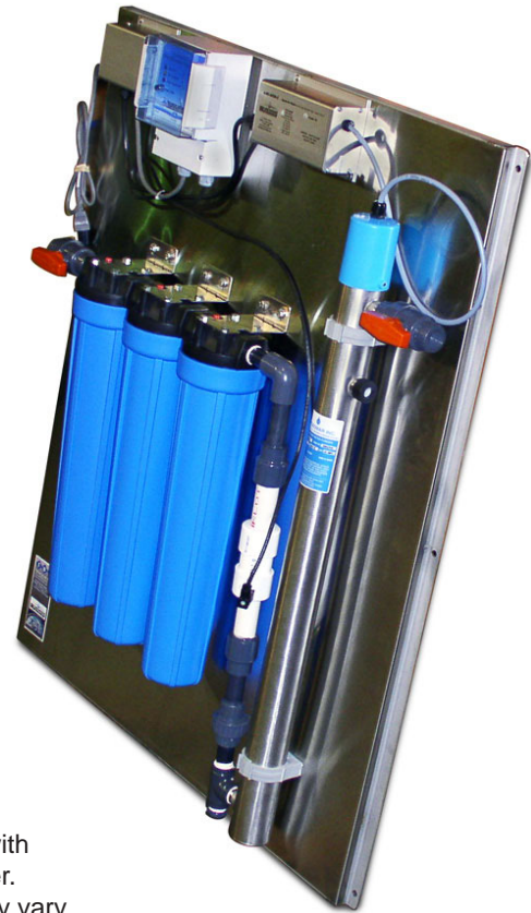
Pictured System with Electronic Descaler. Configurations may vary.

This residential/commercial water purification system offers very efficient water treatment at a low cost per unit volume.