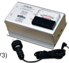
UV Monitor (Part # 4-UV/MS-1/2 V3)

Special Filtration - If other contaminants are present, such as Arsenic, Fluoride, Nitrate or other pollutants, or if the pH needs to be adjusted, additional filtration levels can easily be added to this system.