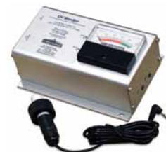
UV Monitor (Part # 4-UV/MS-1/2 V3)

Special Filtration - If other contaminants are present, such as Arsenic, Fluoride, Nitrate or other pollutants, or if the pH needs to be adjusted, additional filtration levels can easily be added to this system.