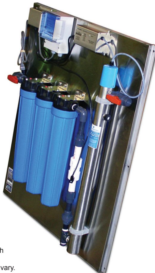
Pictured System with Electronic Descaler. Configurations may vary.