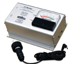
UV Monitor (Part # 4-UV/MS-1/2 V3)

Special Filtration - If other contaminants are present, such as Arsenic, Fluoride, Nitrate or other pollutants, or if the pH needs to be adjusted, additional filtration levels can easily be added to this system.