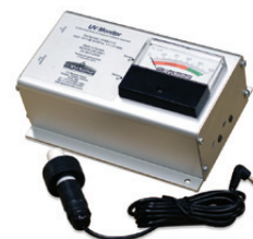
UV Monitor (Part # 4-UV/MS-1/2 V3)

Special Filtration - If other contaminants are present, such as Arsenic, Fluoride, Nitrate or other pollutants, or if the pH needs to be adjusted, additional filtration levels can easily be added to this system.