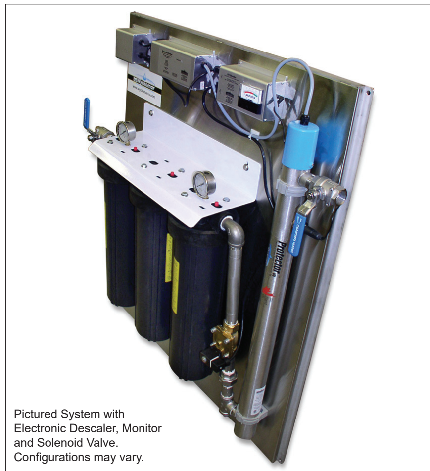
Pictured System with Electronic Descaler, Monitor and Solenoid Valve. Configurations may vary.