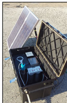
Completely Self Contained Water Treatment for Safe Drinking Water